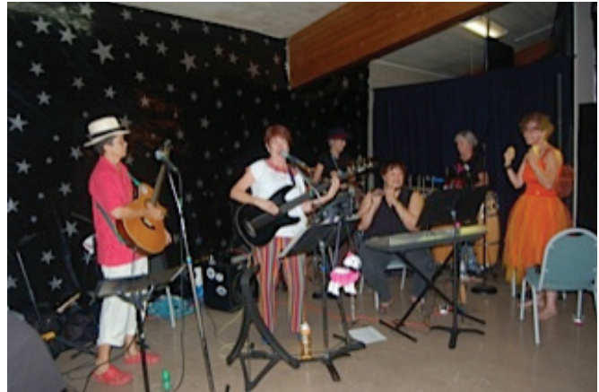
The Gabacha Cha Chas display their musical talent at the Equinox Masquerade Ball.

First UU is a seven-day a week community with activities going on every day to fulfill our mission. These 41 groups reflect the diversity of interest among the entire congregation and give everyone the opportunity to participate. ■